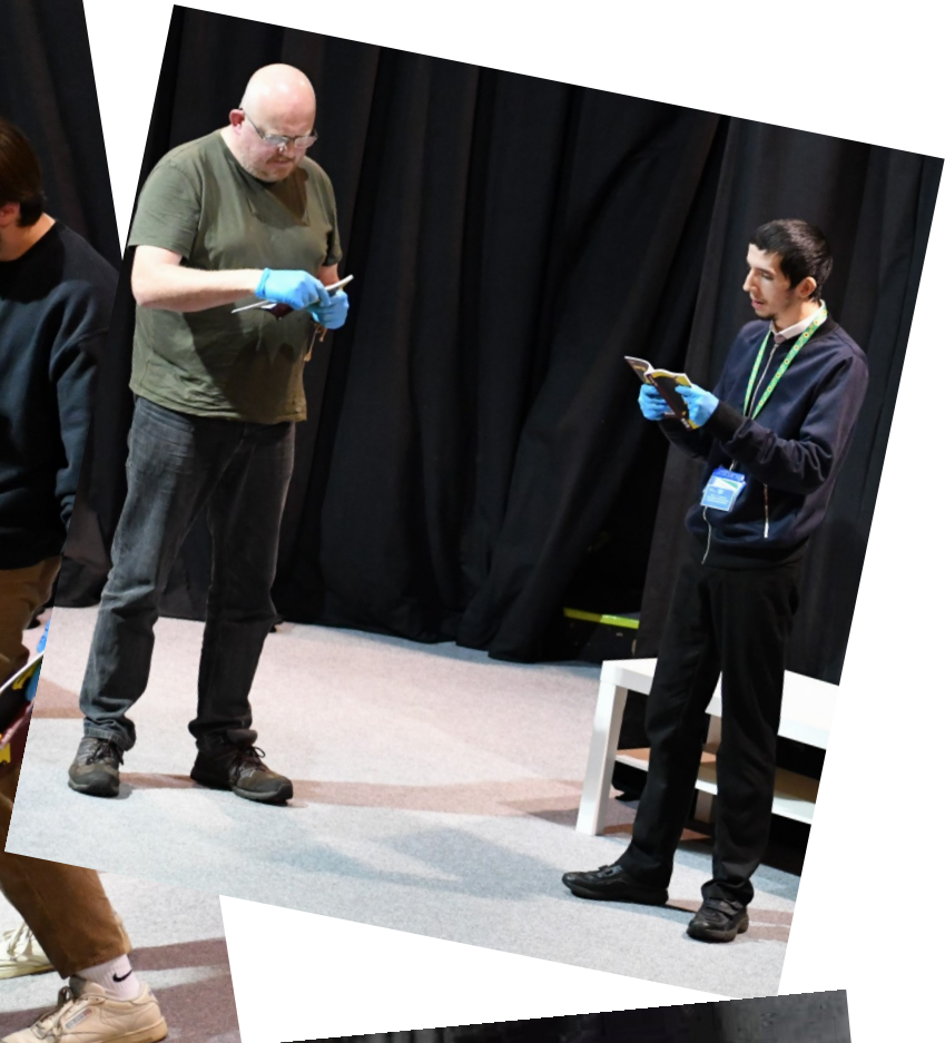
BULL audition and rehearsal photos